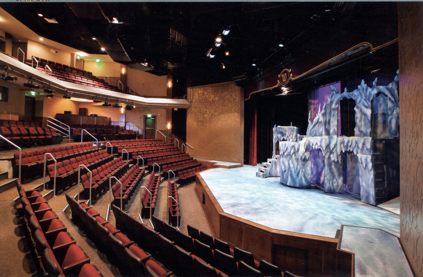
The remodeled theater evokes the feeling of a Broadway experience

and marquee (done with LED bulbs instead of candelabra bulbs). Artist Michael Kane painted trompe l'oeil murals. Crystal chandeliers, ceiling stencils, and lush carpeting dressed up the lobby. Some 100 additional seats were added to the theater with a new mezzanine level (which expanded the theater's capacity to about 400). There were also major upgrades to the theater's sound, lighting, and air conditioning systems. All told, the price tag for the project came in at around $2 million.